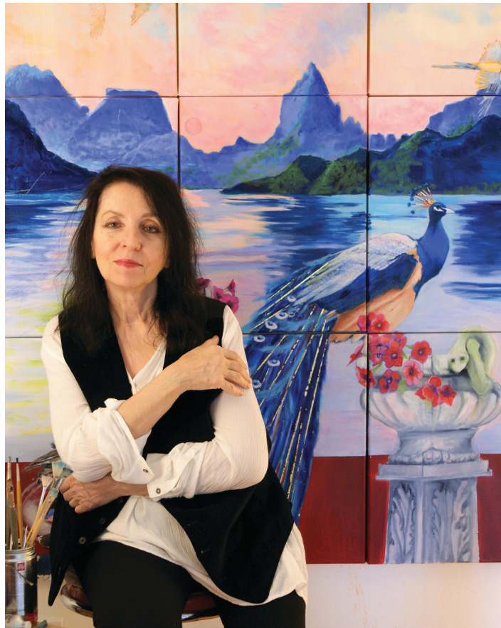
BACKGROUND PAINTING: THE GARDEN WHISPERS THE MESSENGER'S TALE II, OIL ON CANVAS, 55" X 42", 2017