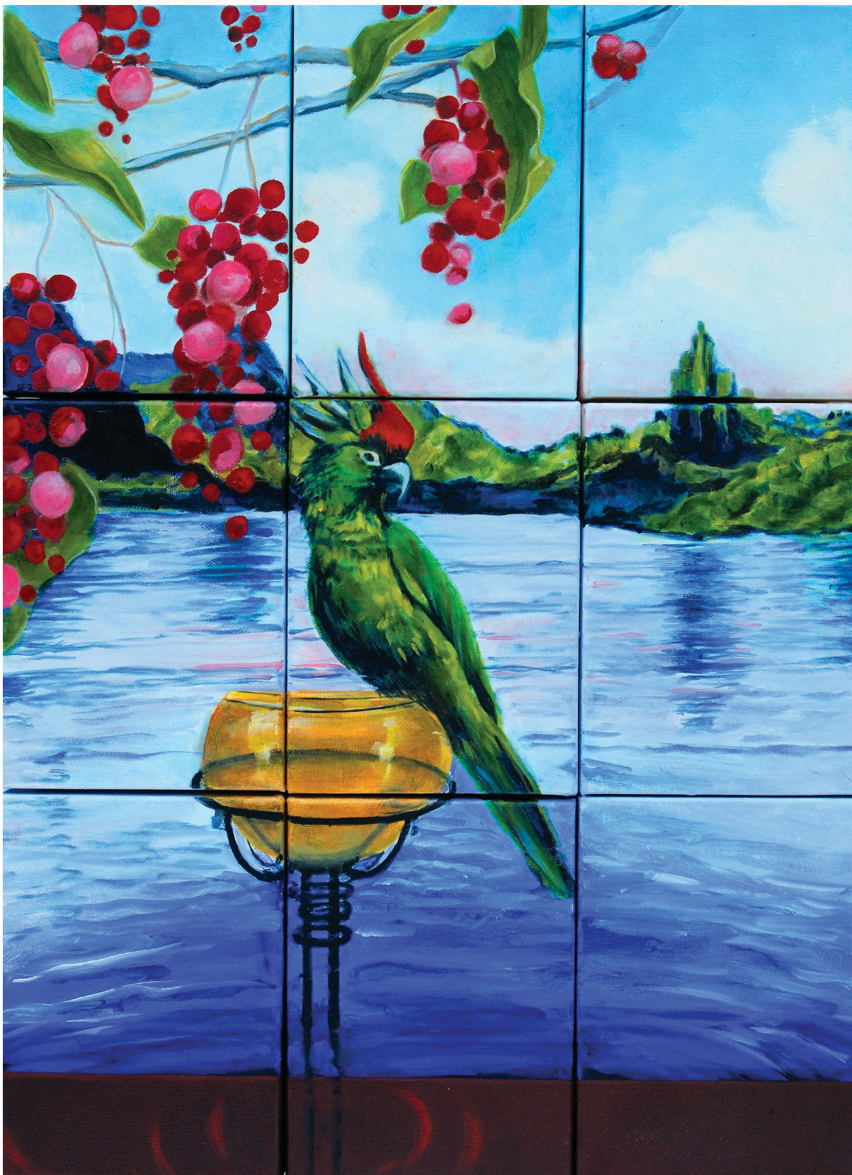
ETERNAL GAZE OF THE MESSENGER II OIL ON CANVAS, 24" X 18", 2017