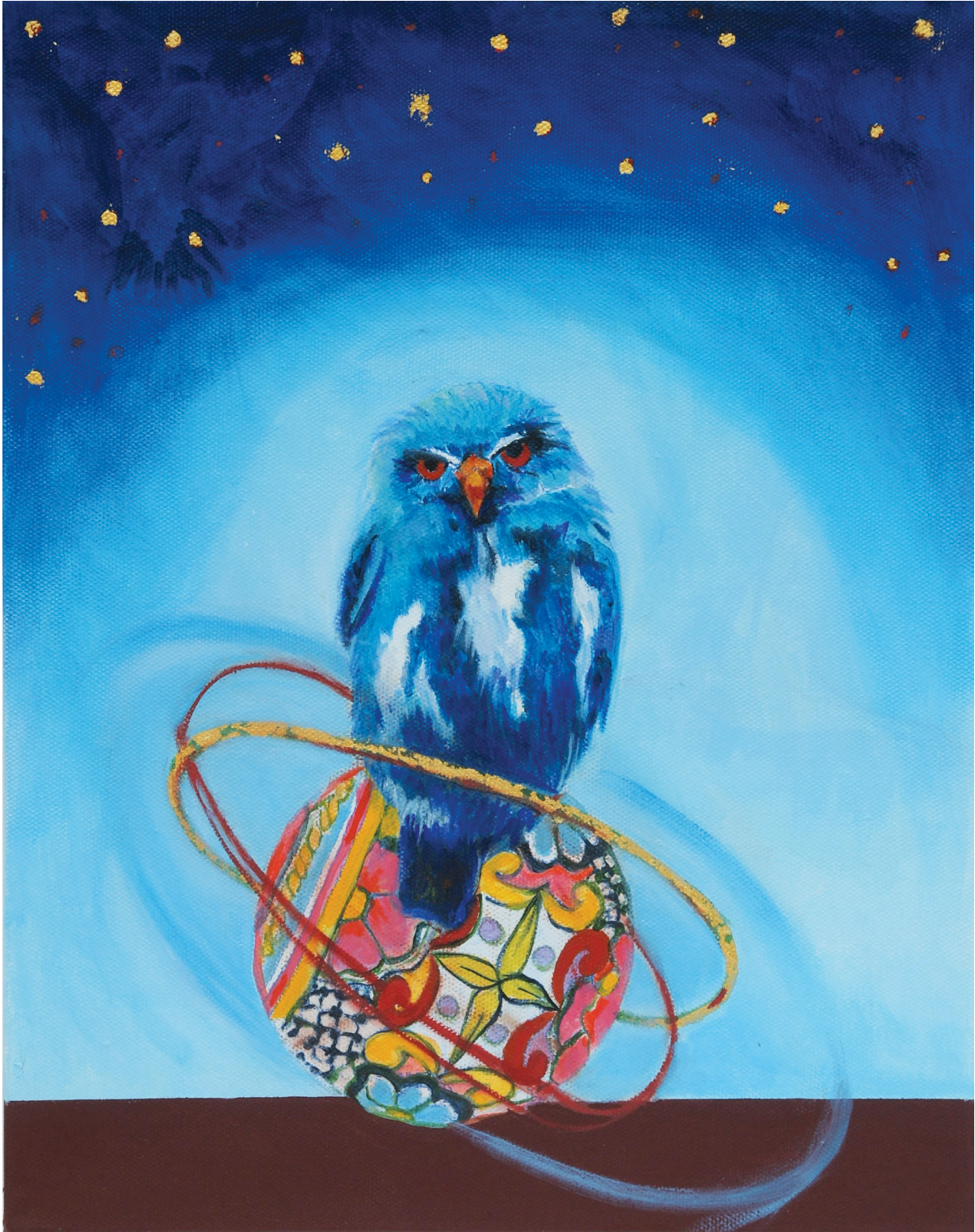
THE PAST IS NOT FINISHED HERE I, OIL ON CANVAS, 11" X 14", 2017