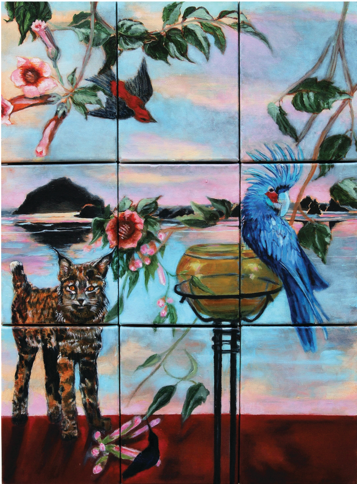
ETERNAL GAZE OF THE MESSENGER III OIL ON CANVAS, 24" X 18", 2017